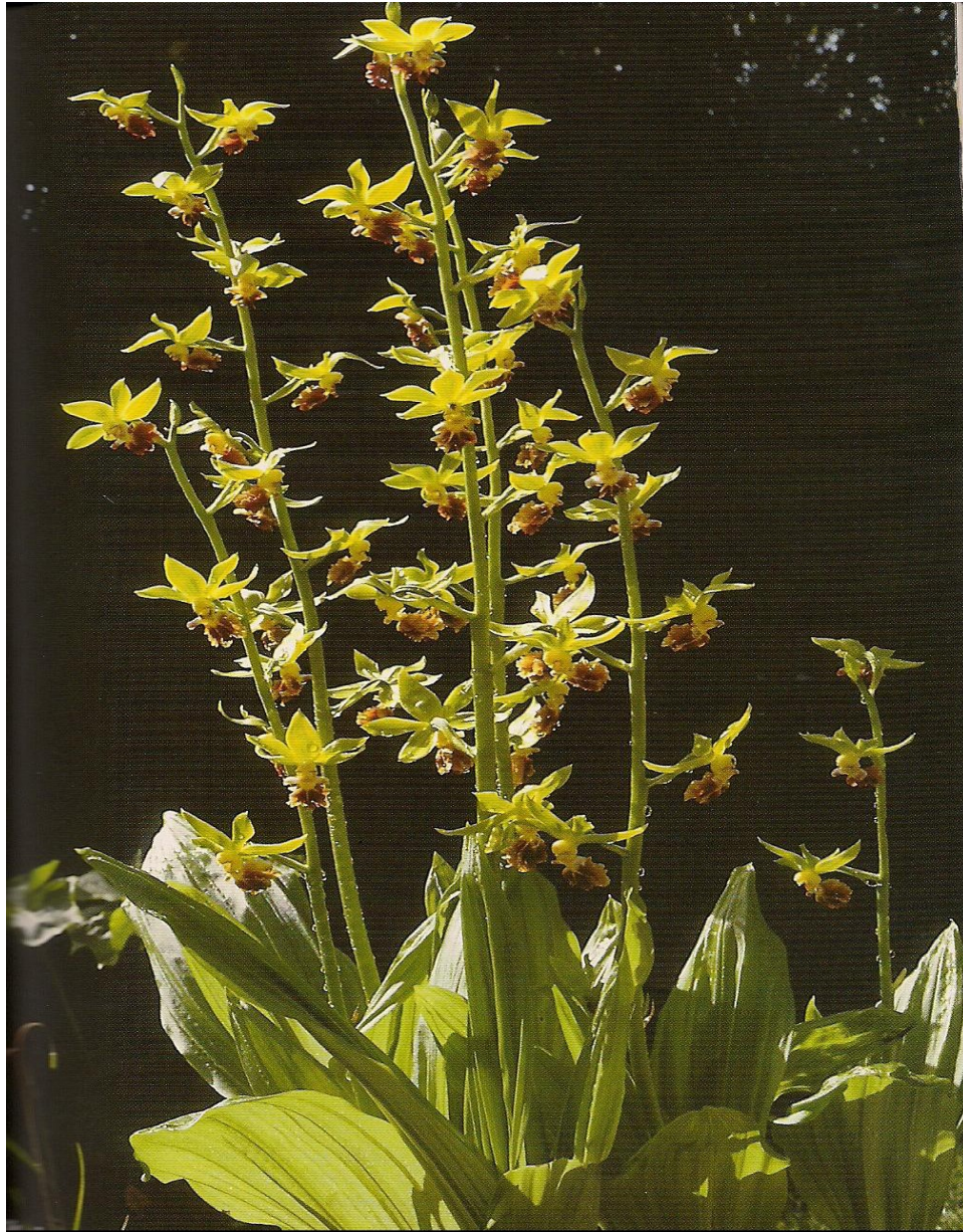
Calanthe tricarinata

Originally published in The Journal of the Scottish Rock Garden Club, Vol.23 No.2 (91), January 1993 and taken from the February 2013 issue of the Central Vancouver Island Orchid Society newsletter.